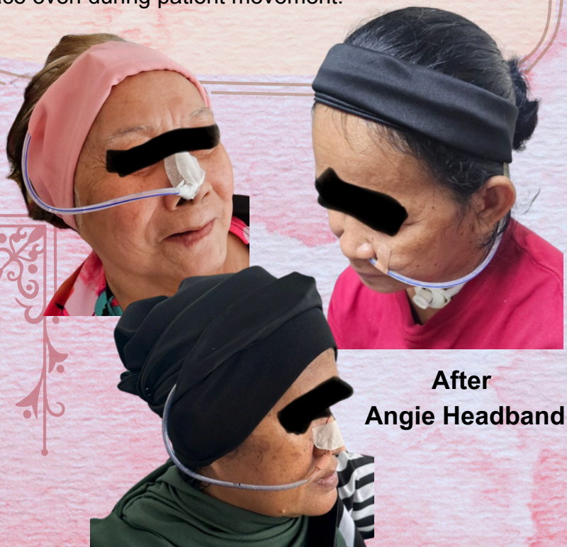
After Angie Headband

Before innovation, conventional method of securing NGT relied on adhesive tapes which were prone to becoming loose, especially in patients with oily or sweaty skin. This often led to the accidental dislodgement of the NGT, requiring repeated insertions, which were uncomfortable for patients and increased the risk of complications like nasal or esophageal injury. With Angie Headband, transferring patients from bed to bed is easier, avoiding accidental pulling of NGT and tube getting stuck to bedsheet. During bed making, no more tangled tubes under the pillow. This promotes safe patient handling. The Angie Headband simplifies the process of securing NGT, is non-invasive, providing a safer and more comfortable tube securing solution for both patients and healthcare providers. A client satisfaction survey was carried out and users were satisfied with this innovation in terms of easy application, user-friendliness, safety and cosmetic acceptance.