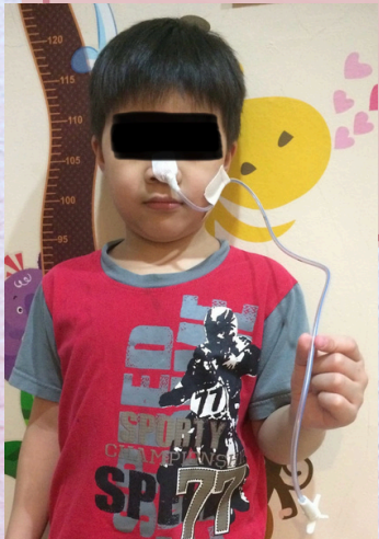
Before Angie Headband

A modified headband- "Angie Headband" is innovated to securely hold NGT in place. Its main function is to prevent the tube from accidental dislodgement, reducing the risk of complications such as aspiration pneumonia and the discomfort associated with repeated NGT insertions. The Angie Headband minimizes the risk of skin irritation and pressure injuries, ensuring that the NGT remains securely in place even during patient movement.